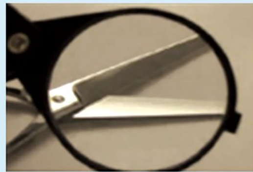
The integrity of the blade will be kept

Some scissors with plastic or rubber bushings will lock up or constantly lose tension and even come apart if not kept in the proper setting. This is caused by stripping the soft threading and rendering the scissor useless! Even oiling will erode the bushings.